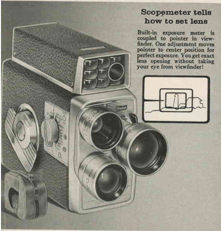
One of Kodak's newest . . . Cine-Scopemeter Turret Camera